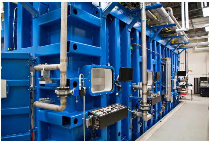
RESEARCH ALTITUDE CHAMBER 1